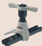
RATCHET FLARING TOOL