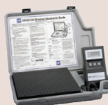
PROGRAMMABLE REFRIGERANT CHARGING SCALE