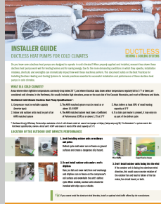
Installer Guide: Ductless Heat Pumps for Cold Climates